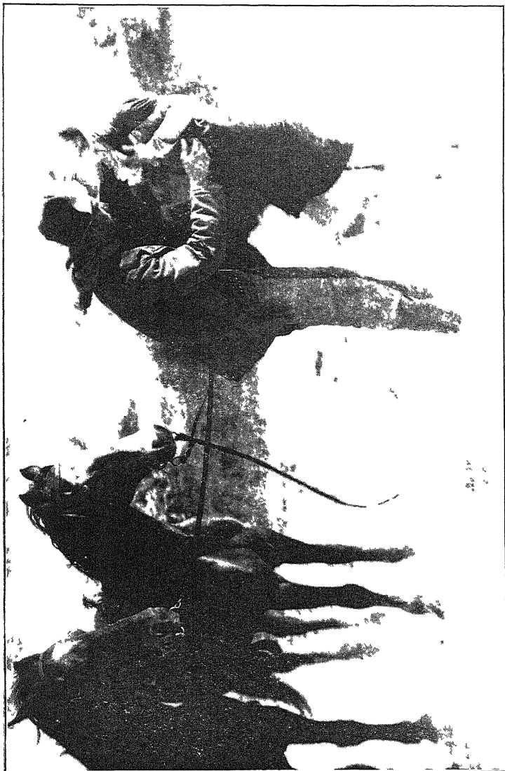
A Metro Goldwyn Mayer Picture

CAUGHT IN A WIND, LETTY REALIZES THAT SHE CANNOT MAKE THE TRIP WITH HER HUSBAND.